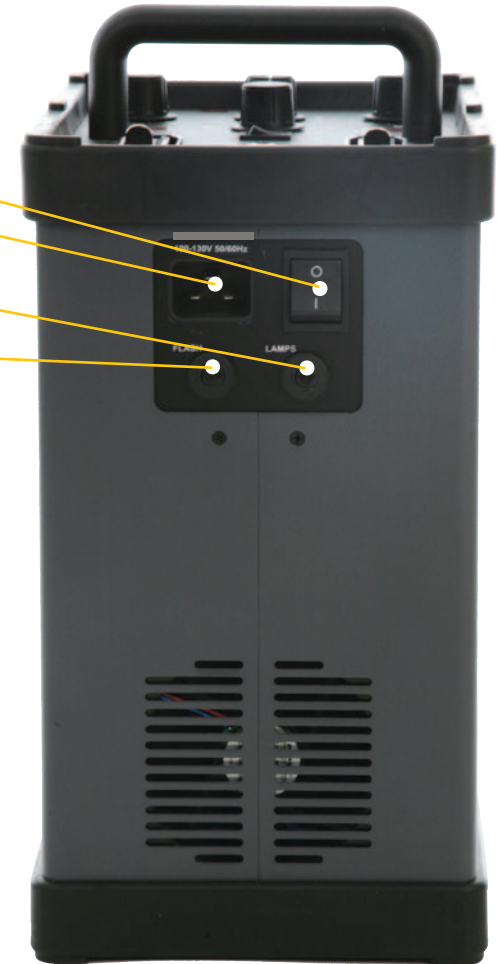
The AC Inlet, On/Off Switch and Thermal Reset Buttons are mounted on the rear panel.

3 The Fast/Slow Switch, Overall Power Selector and Modelling Mode Selector are common to both channels.